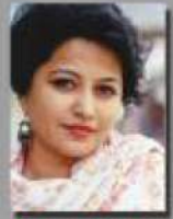
Sucheta Dalal on Are Auditors Accountable?