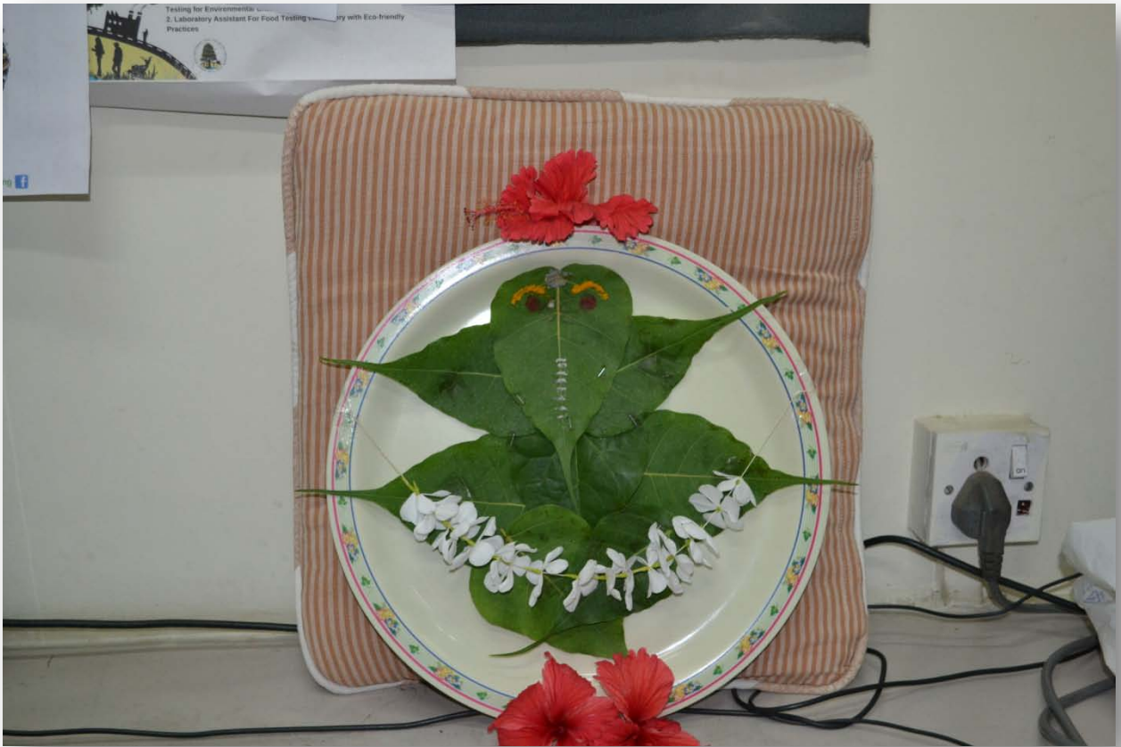
Lord Ganesh made of leaves - Way to celebrate Ganesh Festival in environmental friendly way